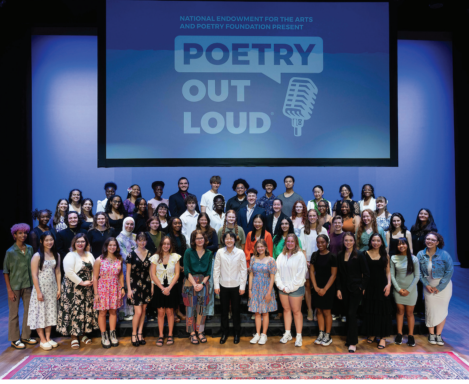
2024 State and Jurisdictional Champions

"Once I dove in and really started to understand the meaning of the poems, it was surprising how 'alike' we are throughout the ages. Love, war, nature, society...the poems may be in different times and places, but the emotions remain the same."