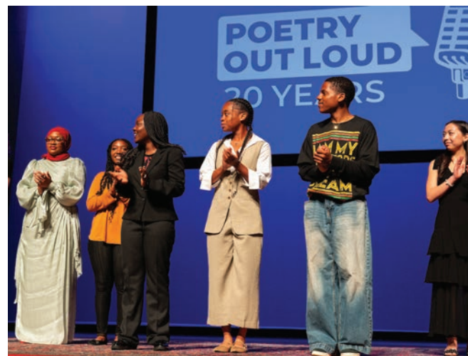
Participants at the 2025 National Finals