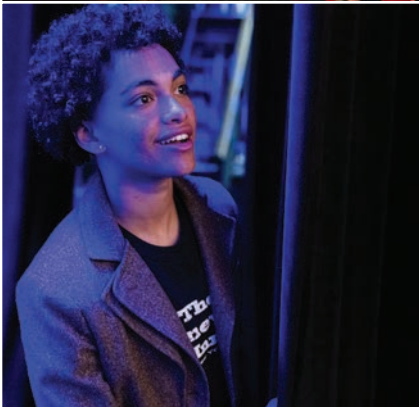
Participants backstage and onstage at the 2025 National Finals